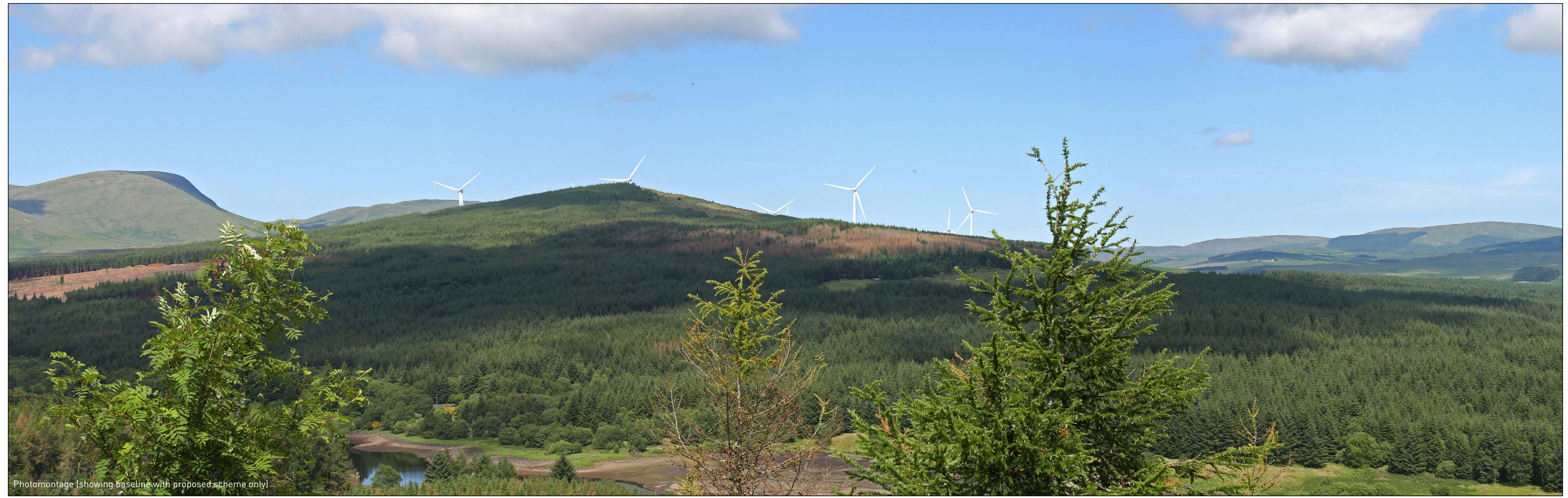
Figure 8.48 (sheet C) Viewpoint 12: Dundeugh Hill SHEPHERDS' RIG WIND FARM